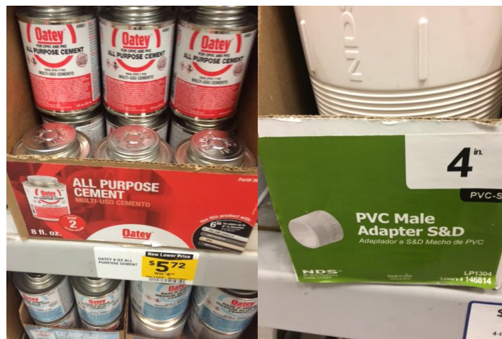
PVC Cement – 1 can and 1 PVC Male Adapter – thin wall