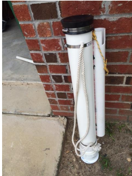
Home made Lion fish Containment Unit