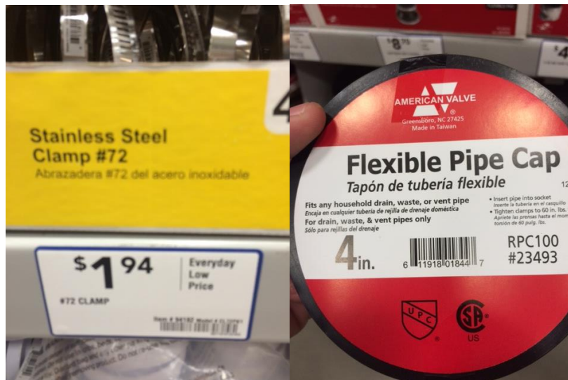
2 # 72 Stainless Steel hose clamps and 1 – 4 inch rubber flexible pipe cap