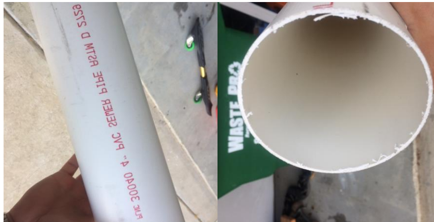
Section of 4 inch PVC sewer pipe, thin wall, cut to desired length