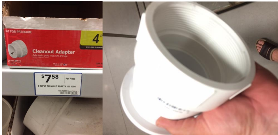
4 inch cleanout adapter – thick wall