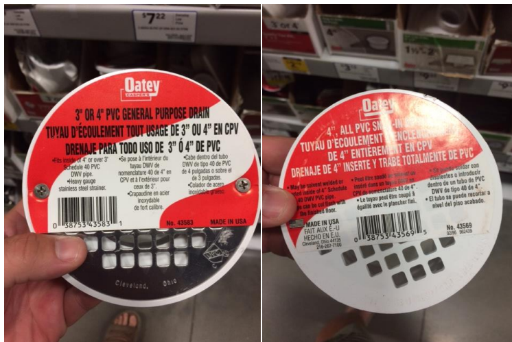
Either a stainless or PVC 4 inch drain